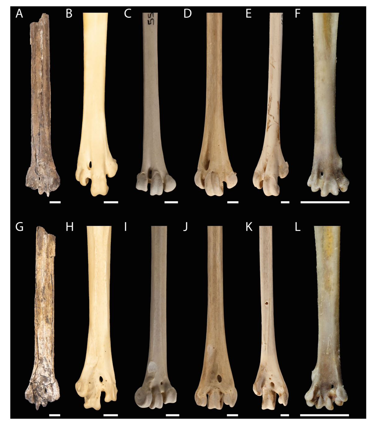
Figure. 3. Tarsometatarsi comparisons. Neognathae incertae sedis (GPIT-PV-122865) in A , dorsal and G , plantar views; Gallus gallus (Galliformes) (GPIT-PV-122866) in B , dorsal and H , plantar views; Ardea herodias (Pelecaniformes) (NMNH 555715) in C , dorsal and I , plantar views; Mycteria americana (Ciconiiformes) (NMNH 16295) in D , dorsal and J , plantar views; Antigone canadensis (Gruiformes) (NMNH 432705) in E , dorsal and K , plantar views; Colius striatus (Coliiformes) (SMF 8019) in F , dorsal and L , plantar views. Images of NMNH 555715, NMNH 16295 and NMNH 432705 obtained from the open-access database of the Smithsonian Institution, Washington DC, USA: https://collections.nmnh.si.edu/search/birds/. Scale bar = 5 mm.

et al. 2013). Estimates of tree density and canopy height suggest ~600 individual trees/ha and a maximum canopy height of around 35 m, which is compatible with swamp forests found in Southeast Asia today (Böhme et al. 2013). Like these modern settings, we expect that the avian fauna was diverse and incorporated a range of arboreal, ground-dwelling, aquatic or semi-aquatic species. Unfortunately, because of the poor preservation, GPIT-PV-122865 cannot be identified beyond Neognathae incertae sedis . Nonetheless, GPIT-PV-122865 does provide the first insight into the Na Duong