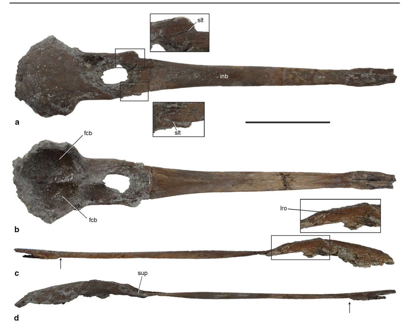
Fig. 1 Skull fragment of a large crane from the early late Miocene of the Hammerschmiede locality in southern Germany (GPIT/AV/00196). a Dorsal view. b Ventral view. c Left lateral view. d Right lateral view. The frames in a and c indicate the position of the