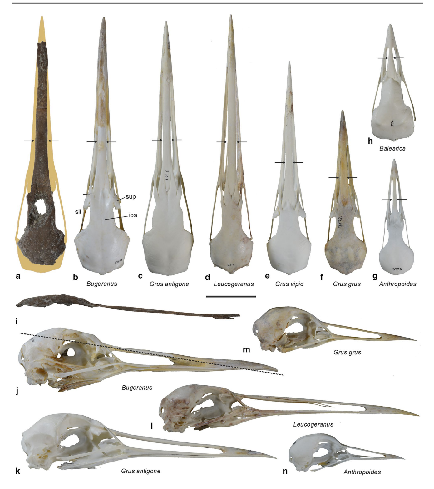
Fig. 2 Skulls of the Hammerschmiede crane and extant Gruidae in dorsal ( a–h ) and lateral ( i–n ) view. a , i the fossil Hammerschmiede crane (the silhouette indicates the reconstructed outline). b , j Bugeranus carunculatus (SMF 19585). c , k Grus antigone (SMF 3759). d , l Leucogeranus leucogeranus (SMF 252). e Grus vipio (SMF 11375). f ,